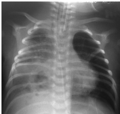
Figure 1 : Necrotizing pneumonia. Chest radiograph showing features of consolidation and multiple areas of radiolucent foci without air-fluid levels in the right lung.

A three-day old term male infant underwent end-to-end anastomosis and fistulectomy for esophageal atresia and tracheo-esophageal fistula. Two days post-operatively, he was extubated, but developed stridor and significant respiratory distress requiring re-ventilation. Several attempts at extubation failed; hence a bronchoscopic examination was performed at day 10, which revealed significant edema at the fistulectomy site (level of the third thoracic vertebra). He was commenced on a tapering course of dexamethasone therapy over five days to facilitate extubation. However, on day 15 of life, he had evidence of sepsis and increased oxygen and ventilatory requirements. He was febrile (temperature of 38° Celsius) and there were coarse crepitations on auscultation of both lung fields. A full blood count showed low total white cell number ( 1.4 \times 10^9 /L) with neutropenia ( 0.9 \times 10^9 /L) and thrombocytopenia ( 93 \times 10^9 /L). Serum C-reactive protein (CRP) was also elevated (21 mg/dL). A chest radiograph showed haziness of the right lung and multiple rounded radiolucent foci with no air-fluid levels (Figure 1). Ultrasonographic examination of the lungs confirmed areas of